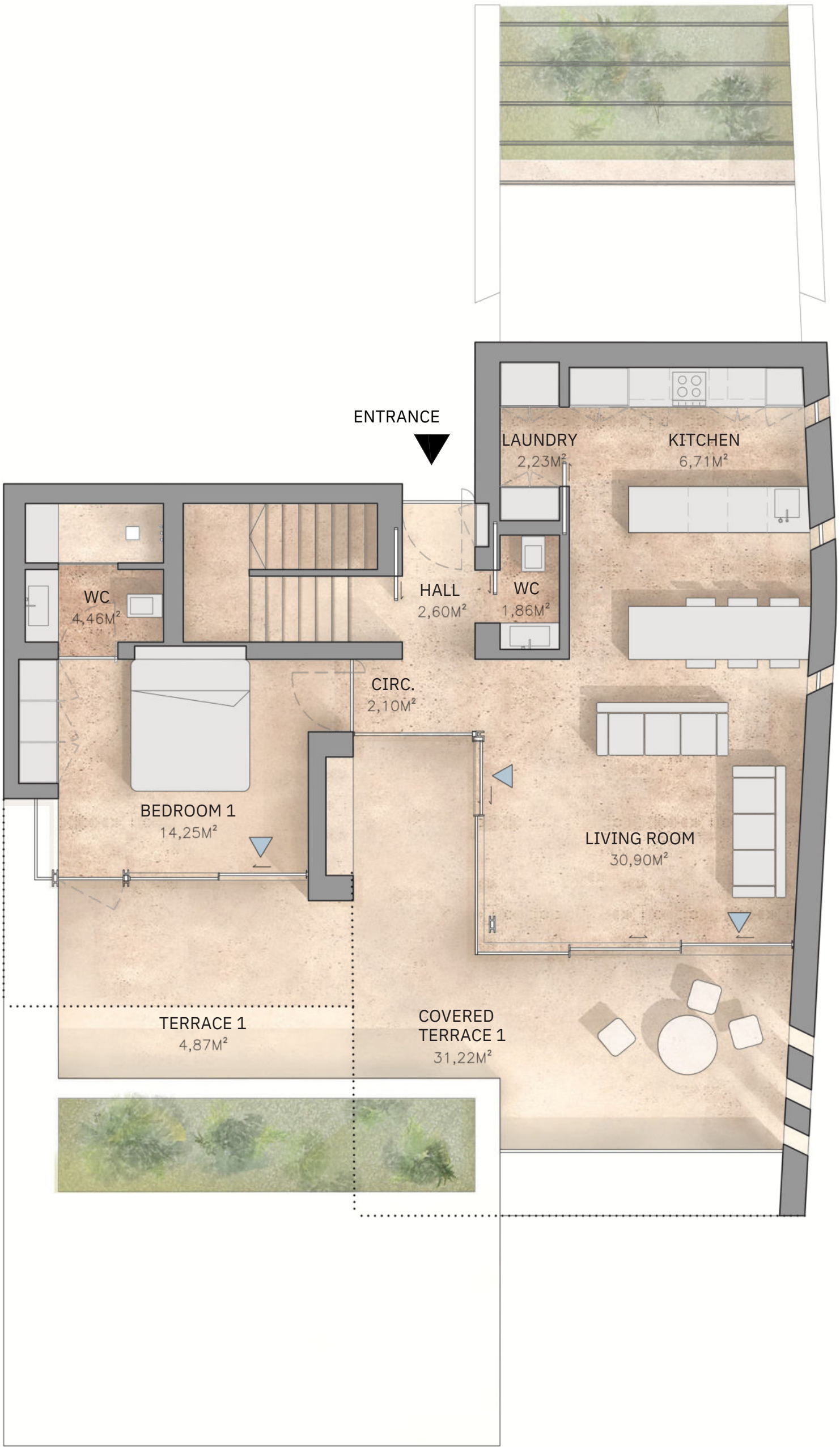
Entrance Floor Plan